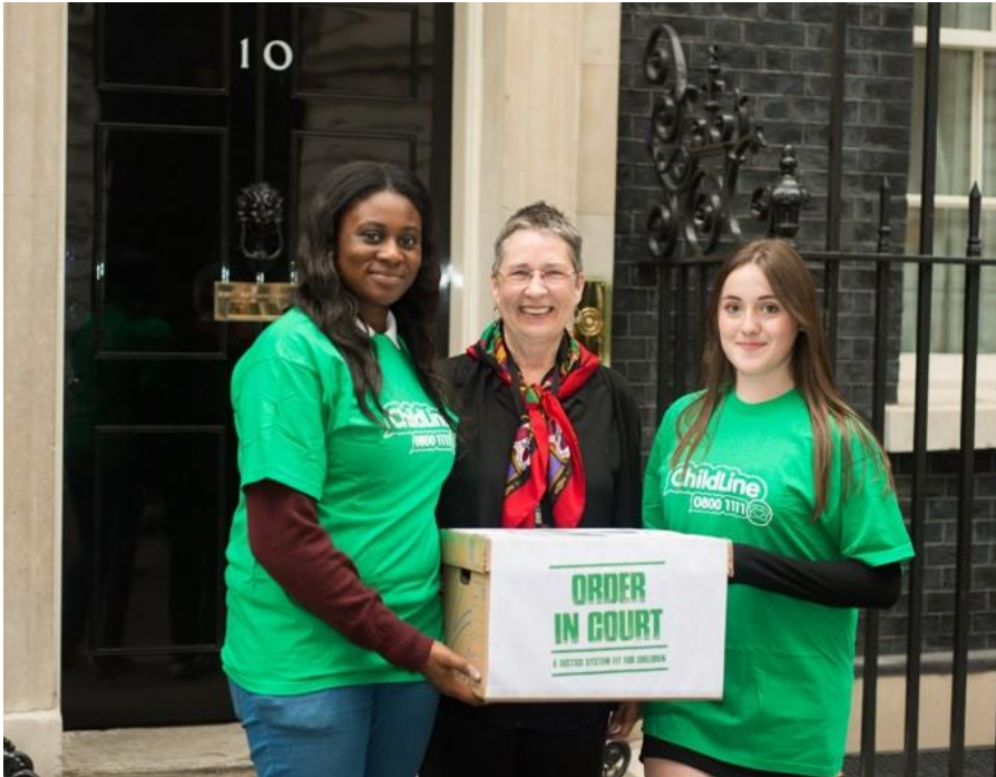
Presenting a petition with the NSPCC at Number 10 Downing Street

The ChildLine Schools Service is another great NSPCC initiative which I have supported in Parliament. Specially trained volunteers go into schools to talk to primary school children about abuse and how to stay safe. Most children contact ChildLine when they are over 11 years old even though the abuse may have been going on for some time. This new project aims to reach out and empower younger children.